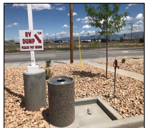
Holiday Oil 7200 W.

https://www.magnawater.com/current-projects .